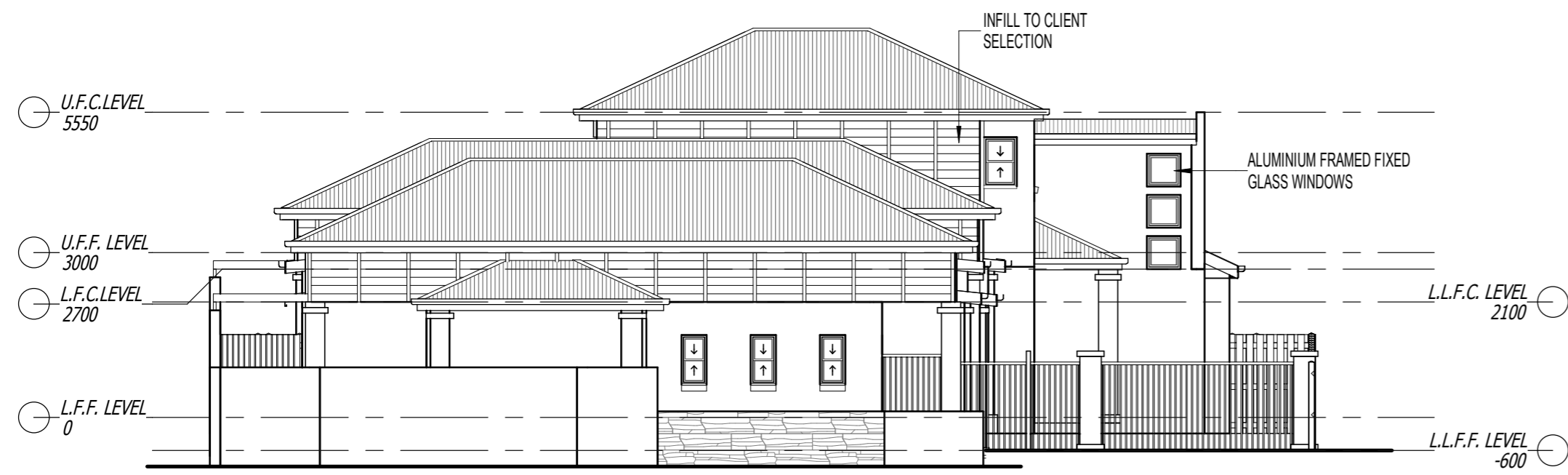
3 elevation to west 1 : 100