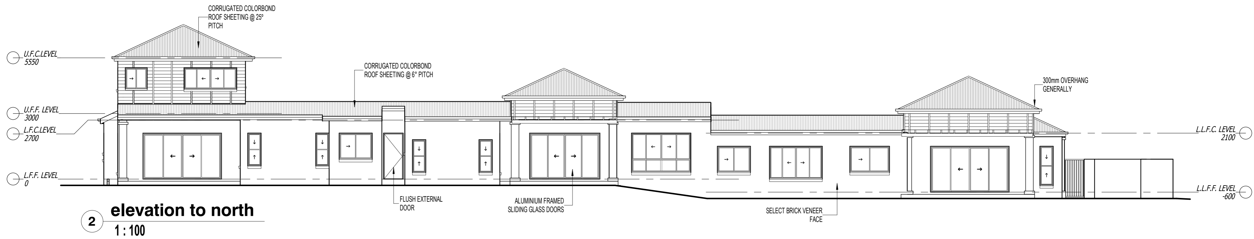
2 elevation to north 1 : 100