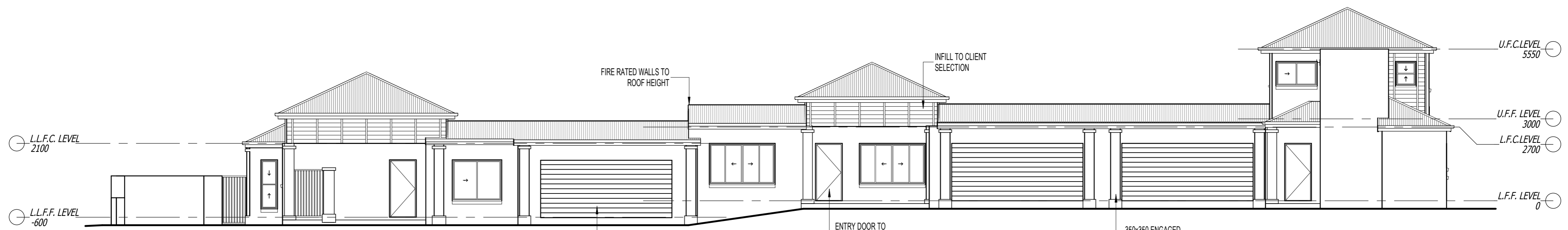
4 elevation to south 1 : 100